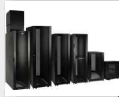
CABINET AND ACCESSORIES