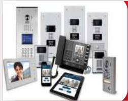
LOW VOLTAGE SYSTEMS AND SOLUTIONS