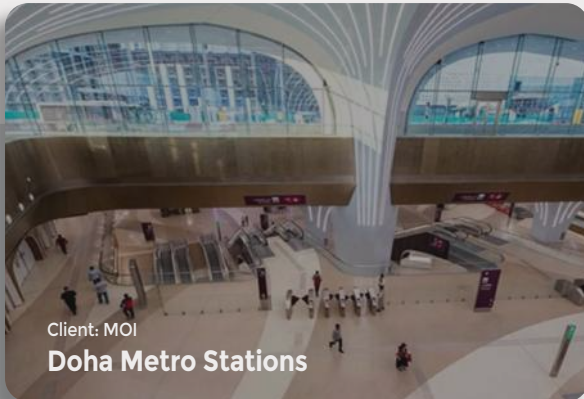
Client: MOI Doha Metro Stations

Project Details: Survey, Design, OFC Laying, Termination and Testing