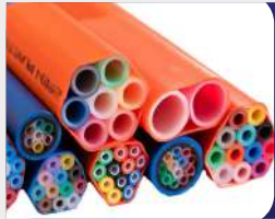
MICRO DUCTS AND ACCESSORIES