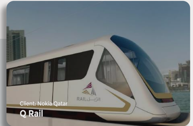
Client: Nokia Qatar Q Rail

Project Details: RAN, SMART POLE, TI, DOT, Small Cell, VSA