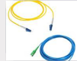
FIBER PATCH CORDS, TERMINATION ACCESSORIES