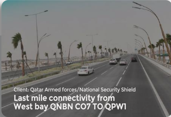
Client: Qatar Armed forces/National Security Shield Last mile connectivity from West bay QNBN CO7 TO QPW1

Project Details: Survey, Design, Civil excavation, Horizontal Directional Drilling in Asphalt road crossings, Manhole construction, Micro duct laying, Fiber Blowing, Splicing & Testing- 31 KM