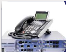
DATA AND TELEPHONE NETWORK SYSTEMS