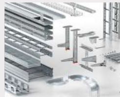
CABLE MANAGEMENT SYSTEM