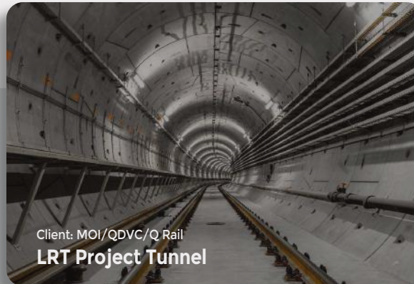
Client: MOI/QDVC/Q Rail LRT Project Tunnel

Project Details: IBS-DAS Passive and Active, FOC, Micro duct laying and fiber blowing, Radiating Cable Installation, termination and testing.