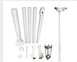
POLE AND ACCESSORIES