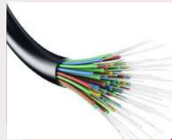
CONVENTIONAL AND BLOWN FIBER OPTIC CABLE AND ACCESSORIES