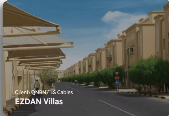
Client: QNBN/LS Cables EZDAN Villas

Project Details: Survey, Design, Civil excavation, Horizontal Directional Drilling in Asphalt road crossings, Manhole construction, Micro duct laying, Fiber Blowing, Splicing & Testing- 31 KM