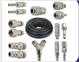
ANCILLARIES & ACCESSORIES