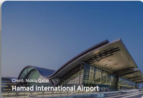
Client: Nokia Qatar Hamad International Airport

Project Details: FTTX, IBS-DAS, RAN, Micro Wave, RSBG, Lamp sites, TE Fixed Frame, DWDM, Data Centers