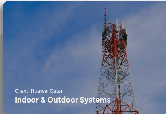
Client: Huawei Qatar Indoor & Outdoor Systems

Project Details: UPS, Poles, MEP and Civil Works