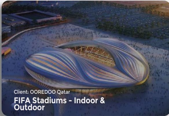
Client: OOREDOO Qatar FIFA Stadiums - Indoor & Outdoor

Project Details: UPS, Poles, MEP and Civil Works